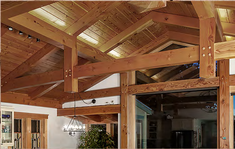
Design & Timber Frame: New Energy Works

Our kiln-dried, premium-quality 1x6 WP4 tongue and groove pattern is milled to 11/16" thickness with a resawn appearance face and surfaced back. It is produced from heart wood, allowing small, tight knots, burls and other natural markings to provide decorative characteristics. This product is ideal for interior and exterior exposed applications.